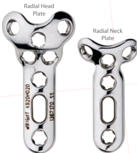
EVOLVE® TRIAD™ Fixation System

Now with plating options: introducing the EVOLVE® TRIAD™ Radial Head and Radial Neck Plates.