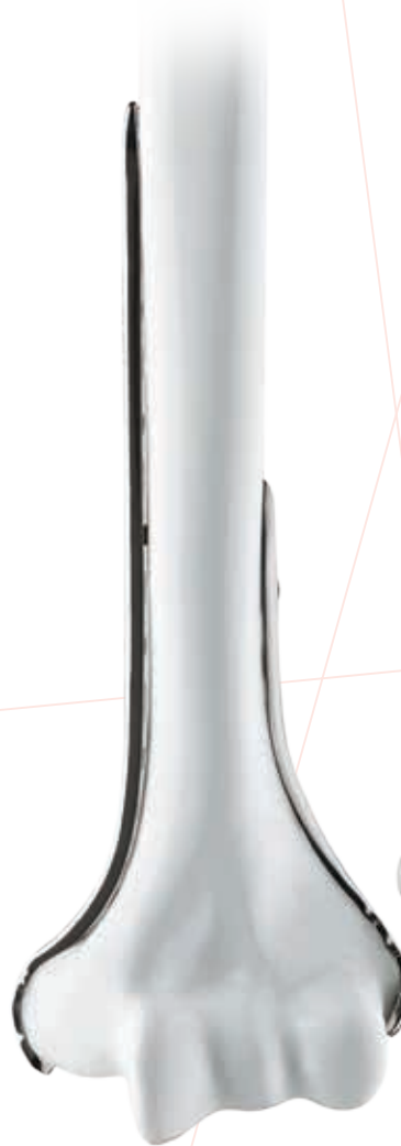
Medial/Lateral - 180° (Parallel)