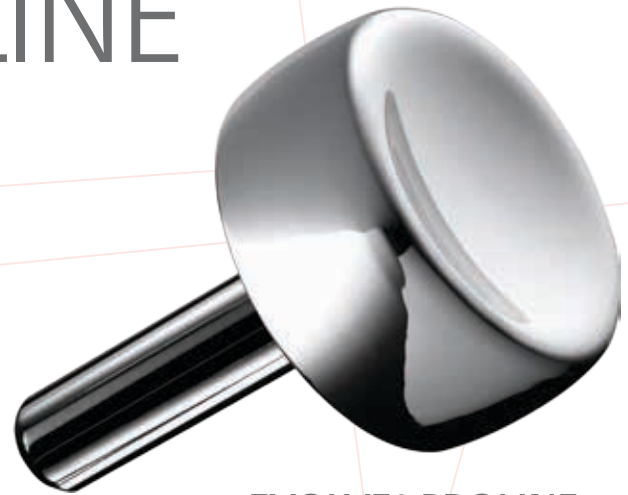
EVOLVE® PROLINE Radial Head System

Now with plating options: introducing the EVOLVE® TRIAD™ Radial Head and Radial Neck Plates.