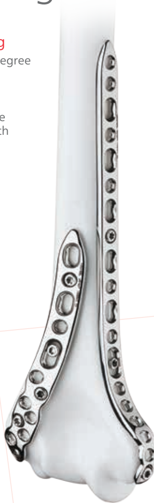
Medial/Posterolateral - 90° (Orthogonal)